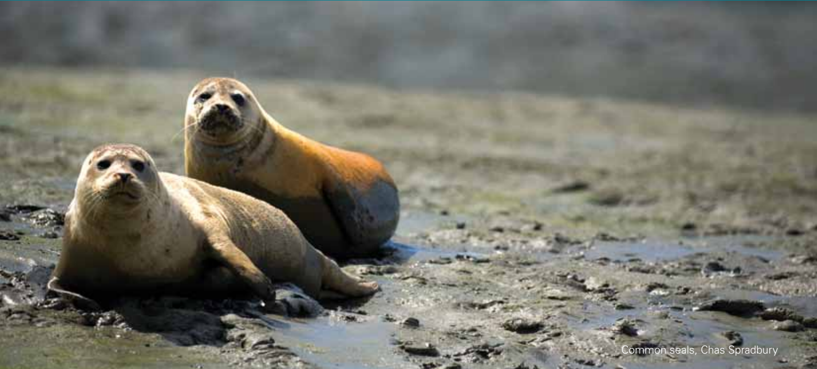
Common seals, Chas Spradbury