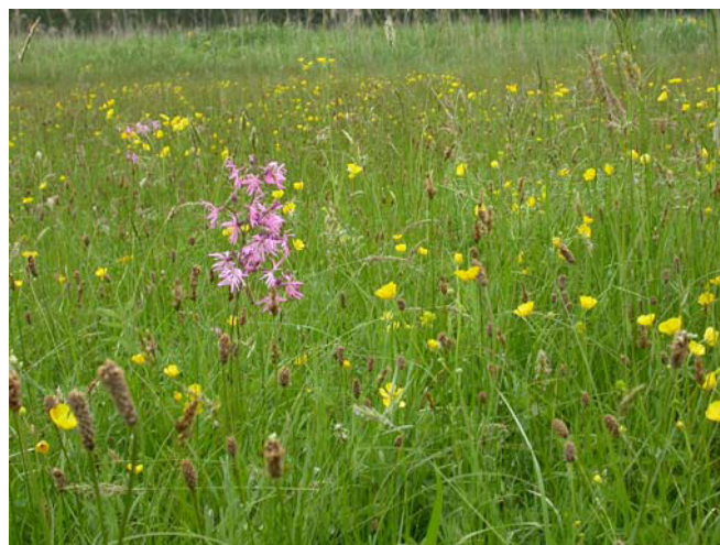
Flower rich hay meadow, Lower Derwent Valley

for maintaining existing species-rich grassland, and for restoring the wildlife interest of degraded grassland.