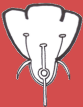
Perigynous flower with superior ovary surrounded by a hypanthium.