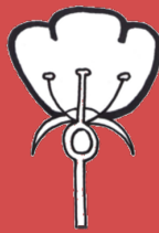
Epigynous flower with inferior ovary below the floral axis.